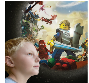
LEGO Futures and strategy