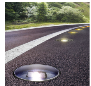
Ray. C Anderson Foundation Electronic systems