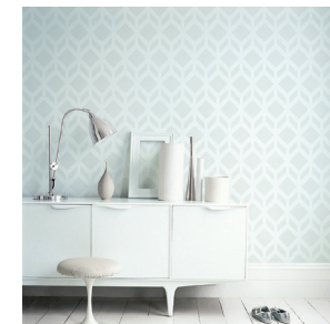
AkzoNobel Interior spaces