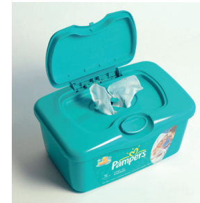
Procter & Gamble Consumer goods

Here is a snapshot of our clients and design sectors we work with: